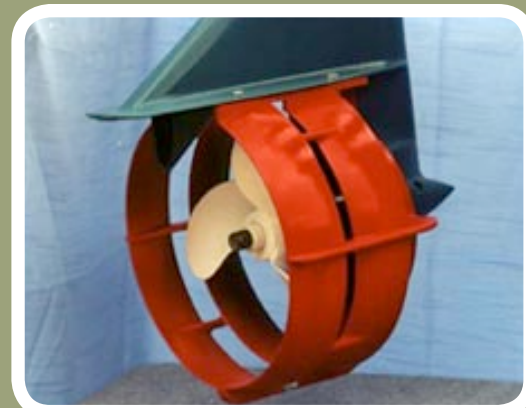
Below: Propeller with guard

Please visit our site for more helpful information: STEMsims.com