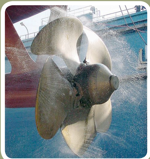
Left: Large Propeller

Since propellers cause so many injuries to manatees, why not require all boats to use propeller guards to protect manatees from injuries? Some boaters do have their boats equipped with propeller guards, which keep manatees from being injured when struck by a turning propeller. However, the state of Florida does not require guards on all boats. The reason? Manatees can still be severely and fatally injured due to collisions with fast-moving boats. Although the guards will prevent manatees from being cut by a propeller, the boat hitting the manatee provides a large enough blunt force trauma to kill the manatee. More than 50% of all watercraft-related manatee deaths were the result of collisions and were not due to propellers cutting the manatees. In fact, some researchers believe that the use of some types of propeller guards by boaters could actually cause an increase in manatee deaths. This is because of the larger surface area the guard occupies in the water as compared to a regular propeller.